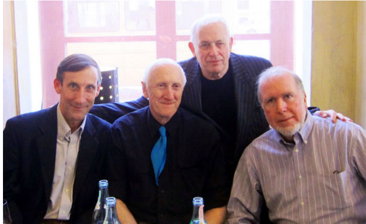
George Dyson, Stewart Brand, John Brockman, Kevin Kelly

Stewart Brand is the founder and editor of Whole Earth Catalog and author of Whole Earth Discipline ; Kevin Kelly helped to launch Wired in 1993 and is the author of Out of Control and What Technology Wants ; and George Dyson , a science historian, is the author of Darwin Among the Machines and Turing's Cathedral . This year, Laurie Santos , Associate Professor of Psychology, and Director of the Comparative Cognition Library at Yale, became involved, adding to the mix her keen intellect as well as a wide range of contacts among the leading thinkers of her generation.